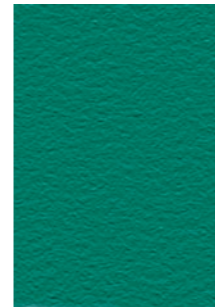
Phthalo Green BWS8