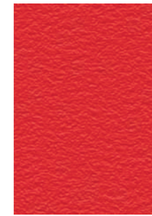
Spectrum Red Deep BWS7