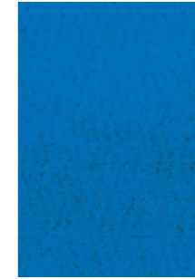
Phthalo Blue BWS8