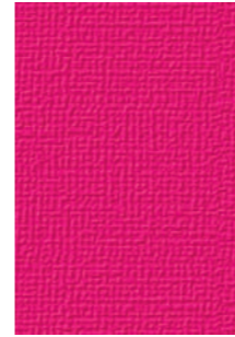
Permanent Magenta BWS7