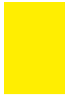
Spectrum Yellow BWS7