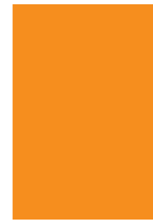
Spectrum Orange BWS7