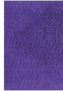
Permanent Violet BWS8