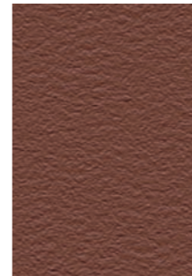
Burnt Sienna BWS7