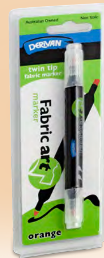
Twin Tip Marker