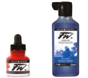
FW Ink 29.5ml D 160 029 *** FW Ink 180ml D 160 181 ***